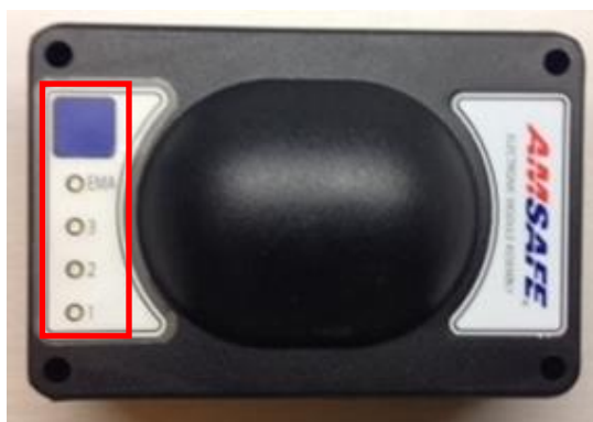
Figure 5. EMA PTT Panel

Diagnostics are performed every 4000 flight-hours or 12 months (whichever occurs first). Diagnostics are performed via a push-to-test (PTT) function embedded in the EMA. The PTT panel has a blue PTT button and four indicator lights (Figure 5) of pass/fail conditions. Pressing the blue PTT button initiates the microcontroller to perform a diagnostic test that checks the continuity of the activation circuit, battery life and the inflator assembly resistance.