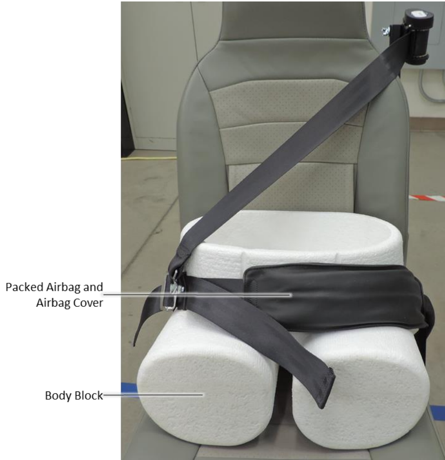
Figure 6. Body Block and Packed Airbag