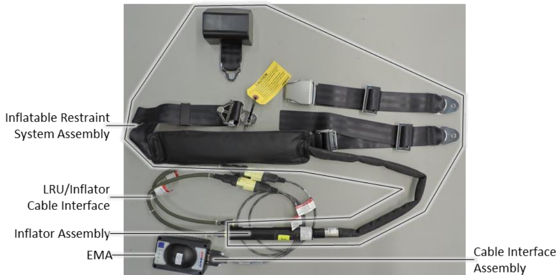
Figure 1. SOARS