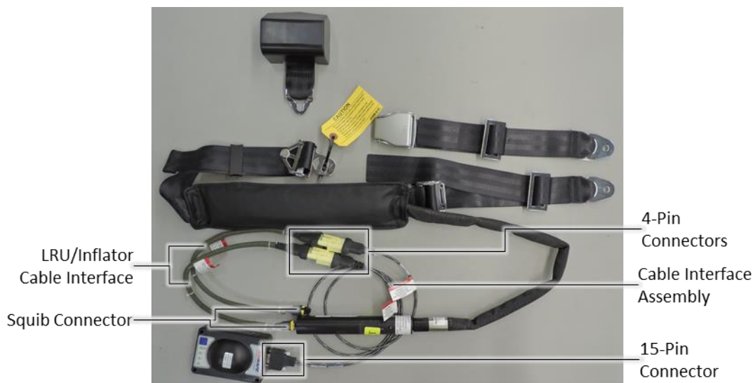
Figure 4. Connectors

The cable interface assembly and LRU/inflator cable interface are not connected to aircraft power or ground and both cables meet the applicable requirements for electromagnetic interference (EMI), electromagnetic compatibility (EMC), high-intensity radio fields (HIRF) and environmental and flammability testing.