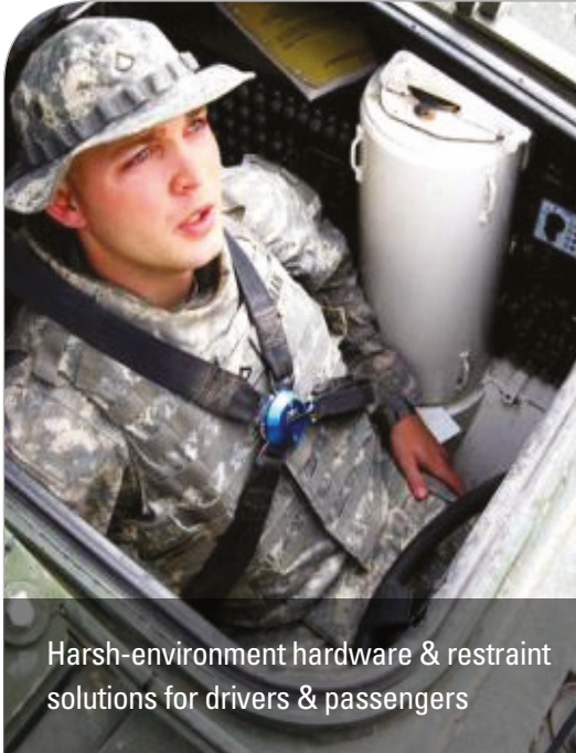
Harsh-environment hardware & restraint solutions for drivers & passengers

AmSafe products are focused on ease of use and comfort to encourage usage