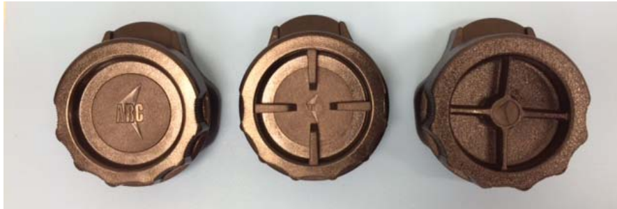
Figure 1: 1150004-SERIES Rotary Buckles

This Service Bulletin is applicable to the Restraint System Assemblies installed on the pilot and co-pilot seats using the 1150004-SERIES Rotary Buckles (see Figure 1) manufactured December 2013 to April 2016.