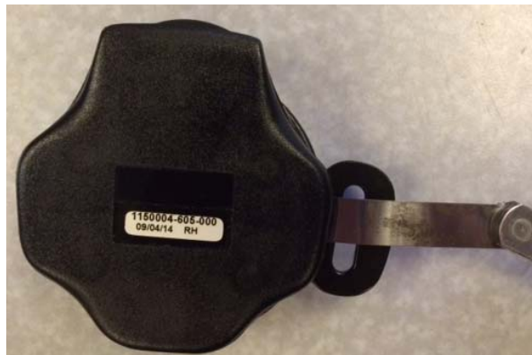
Figure 4: Inserting Feeler Gauge to Release Fixed Connector