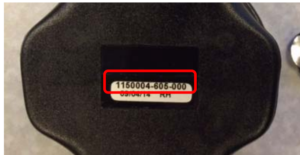
Figure 6: Buckle PN