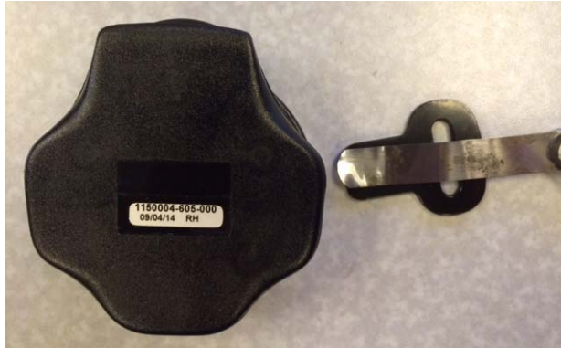
Figure 5: Withdraw the Feeler Gauge and Connector