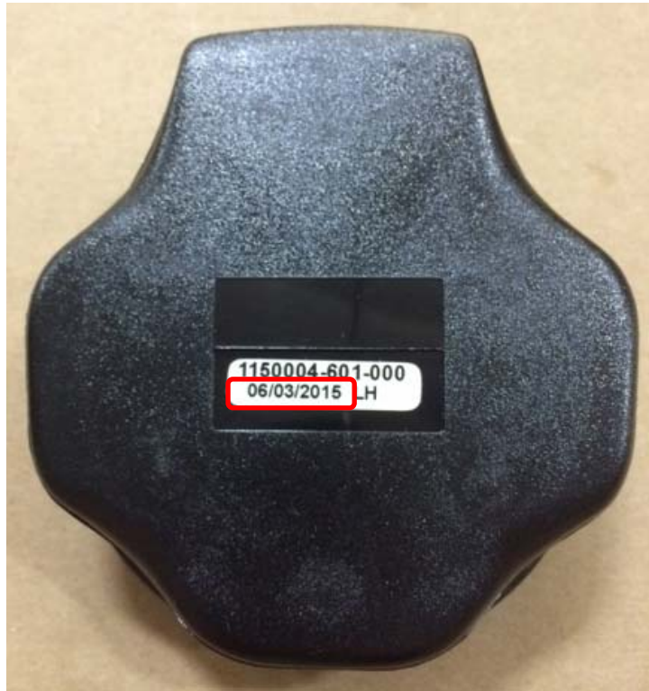
Figure 3: Manufacturing Date Found on Buckle Label