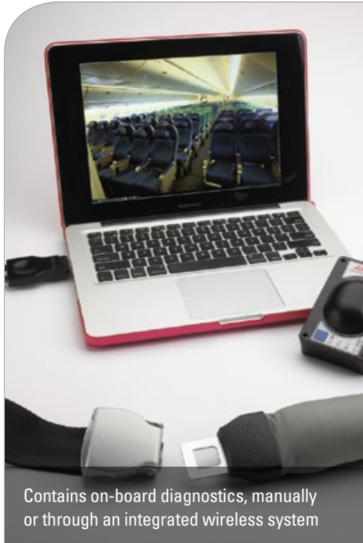
Contains on-board diagnostics, manually or through an integrated wireless system