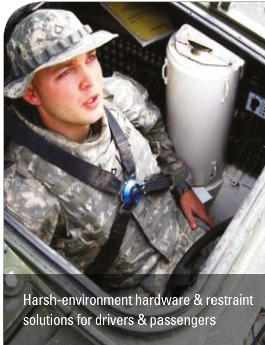
Harsh-environment hardware & restraint solutions for drivers & passengers

AmSafe products are focused on ease of use and comfort to encourage usage