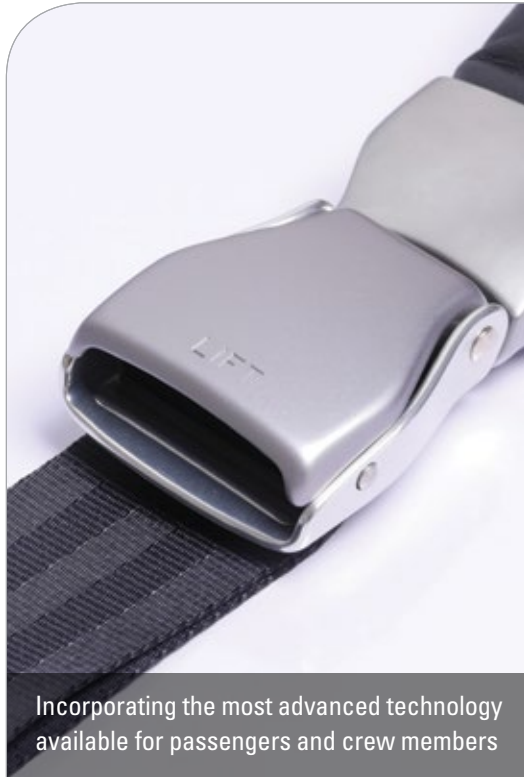
Incorporating the most advanced technology available for passengers and crew members

AmSafe restraints incorporate the most advanced technology available for passengers and crew members. We use advanced materials, manufacturing techniques, in-house dynamic testing, and continual research and development to ensure that passengers and crew are safe and secure.