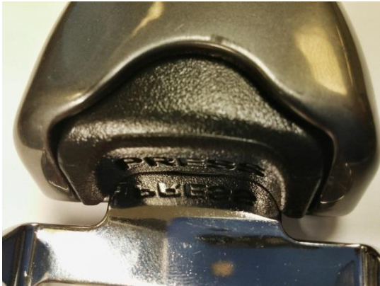
Figure 1: Fully Engaged Connector.