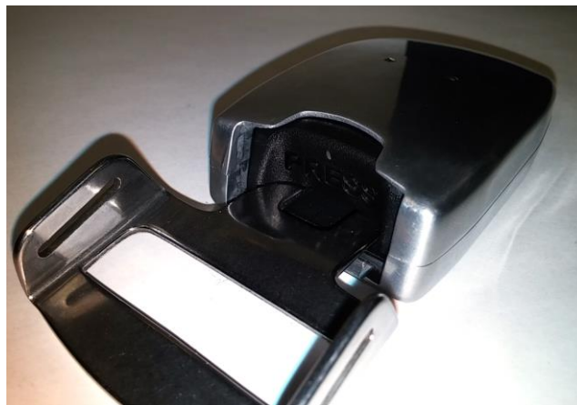
Figure 3: Push Button not Returning when Connector Inserted.