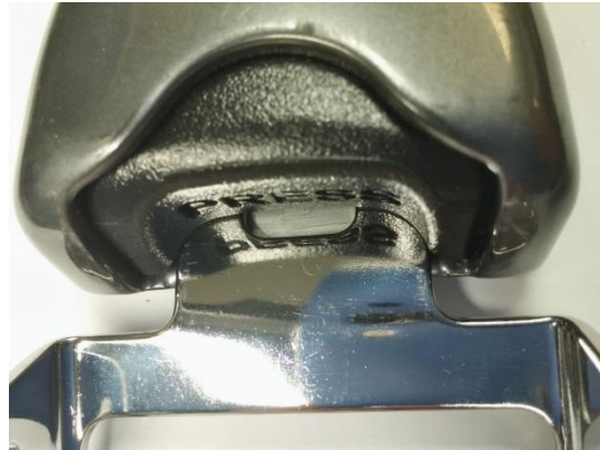
Figure 2: Connector not Fully Engaged.