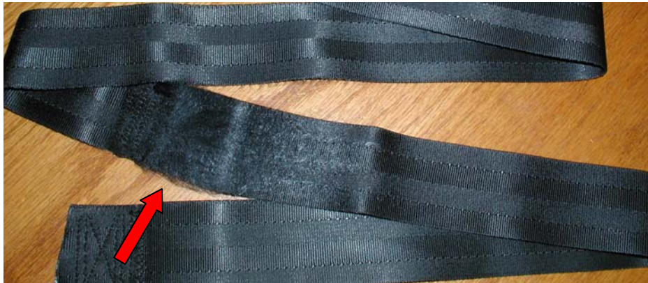
Figure 4: “Very Frayed” – exterior of webbing is substantially worn and damaged