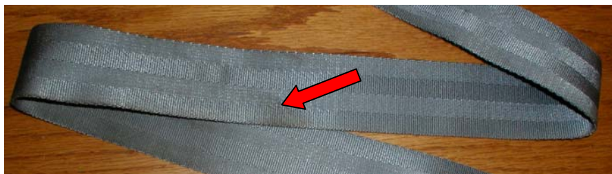
Figure 8: “Slight Discoloration” – small amount of dirt or fading color