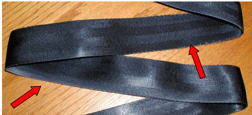
Figure 2: “Slight Fraying” – edges of webbing are partially tattered and/or worn