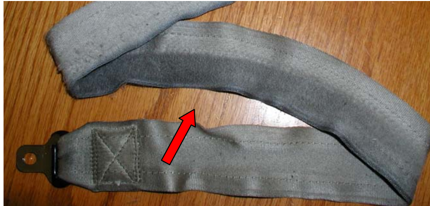
Figure 12: “Very Warped” – large amount of webbing curvature (usually occurs with very frayed sides and sometimes with discoloration)