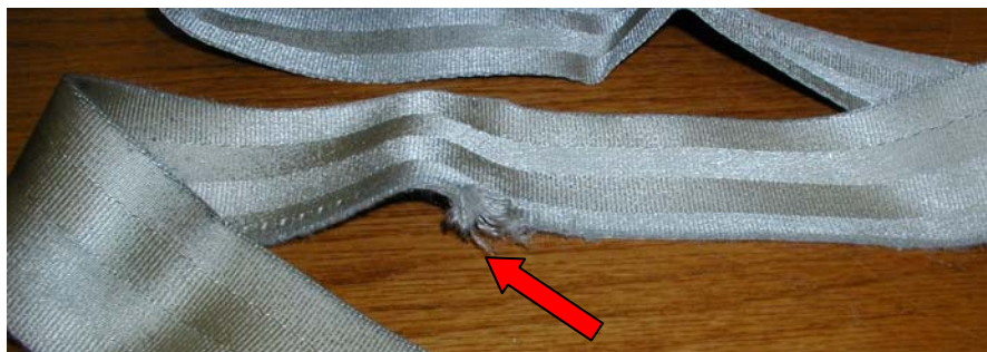
Figure 5: “Small Rip” – torn less than 0.5 inches on edge of webbing