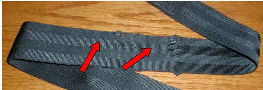
Figure 7: “Heavy Ripping” – tear exceeding 3 inches on edge of webbing or multiple tears exceeding 0.5 inches throughout webbing