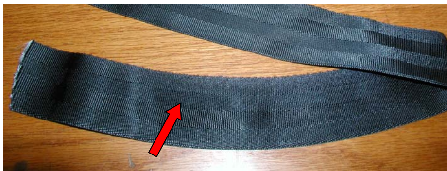
Figure 11: “Warped” – fair amount of webbing curvature (usually occurs with fraying along one side)