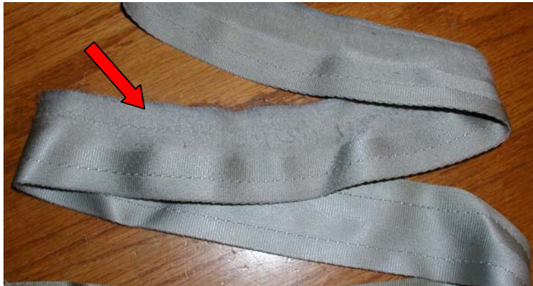
Figure 3: “Fraying” – exterior and/or edges of webbing are tattered or worn and damaged