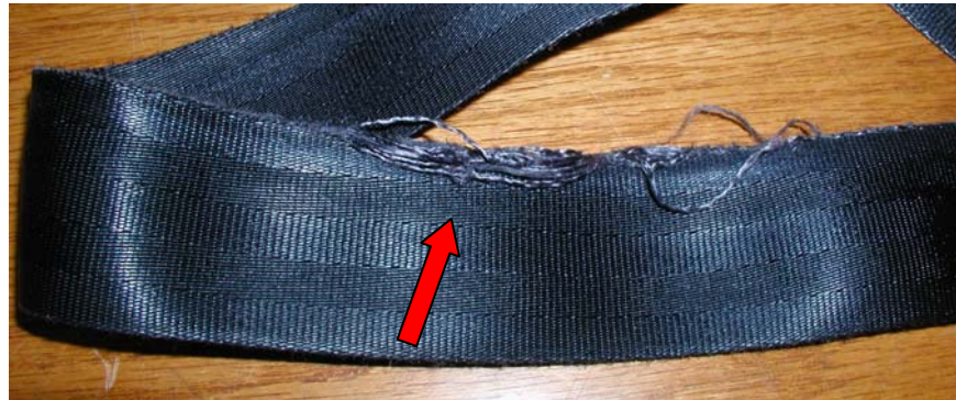
Figure 6: “Ripped” – torn between 0.5 and 3 inches on edge of webbing