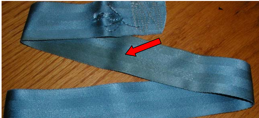
Figure 9: “Discoloration” – fair amount of dirt or fading color