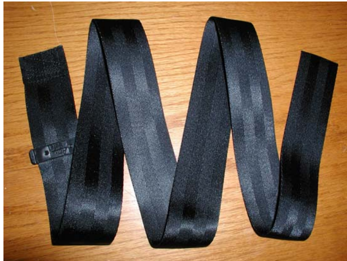
Figure 1: “Looks New” – no visible flaws