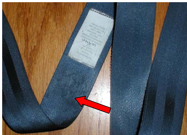
Figure 13: “Scratched” – minor surface scratches and scuffs on webbing exterior