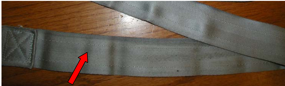
Figure 10: “Slightly Warped” – small amount of webbing curvature (usually occurs with small fraying along one side)