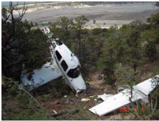
The Cirrus SR22 crashed and slowly broke through trees. There were no injuries and the AmSafe Aviation Airbags did not deploy [7].

Another example of a more serious accident, but one with only minor injury potential, occurs if the impact is dissipated progressively. The AmSafe Aviation Airbag crash sensor activates only on an impact large enough to threaten serious injury.