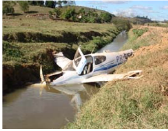
The Cirrus SR22 crashed upon takeoff. There were no serious injuries and the AmSafe Aviation Airbag deployed upon impact [8].

Deployments in the field have also indicated the appropriate crash sensor threshold. They have occurred in accidents where the potential for serious injury existed but only minor injury occurred. The AmSafe Aviation Airbag has been deployed in the accidents where serious injuries have occurred. There have also been serious/fatal and non-survivable accidents.