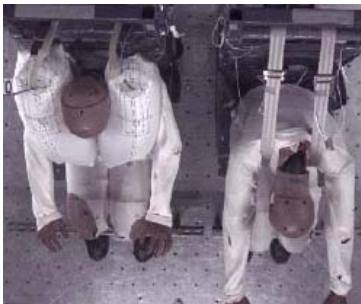
The tubular AmSafe Aviation Airbag four-point restraint compared to a standard four-point restraint.

Other applications use the bag differently. The bag can distribute restraint loads to the occupant early in the event, reducing the momentum caused by the occupant articulating forward. This reduces the peak seatbelt forces, spreading them over a longer time interval.