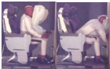
100 ms 140 ms The AmSafe Aviation Airbag functions during a 16g, 180ms impact. It is installed in the front row economy behind a bulkhead.

The AmSafe Aviation Airbag entered service on commercial aircraft in February 2001. The first use was for transport aircraft that needed to comply with the improved crash safety regulations of FAR 25.562 [1]. These regulations introduced dynamic loading requirements for aircraft seats in 1988. Dynamic impact tests with an Anthropomorphic Test Dummy (ATD) are now common to ensure that all civil aircraft seats and floor attachments comply with the FAR 25.562 regulation. The Head Injury Criteria (HIC), a measure of injury potential from head impact, was introduced with the FAR 25.562 regulation in 1988.