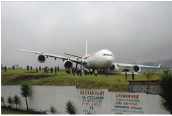
Iberia Airlines A340-600 overshot the runway in Ecuador. There were no injuries. AmSafe Aviation Airbags did not deploy [6].

and no inadvertent deployments have been recorded.