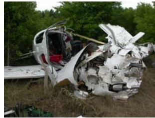
The Cirrus SR22 crashed upon approach. AmSafe Aviation Airbags deployed and occupants with serious injuries evacuated [9].

Accidents have occurred with the airbags deployed, and the occupants were able to evacuate the aircraft despite having sustained serious injury.