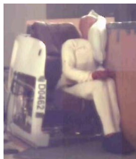
Airbag protection from impact to side-mounted furniture in a premium seat mounted at an angle to the aircraft axis.

In the AmSafe Aviation Airbag configuration, the airbag is mounted onto the restraint and has modular components with highly adaptable attachments. This configuration meets the requirements of both design and market acceptance. Aircraft that use this configuration can greatly expand the flexibility of the interior design. Many new premium-class interiors are possible only because the airbag mitigates occupant flailing and because it passes injury prevention requirements.