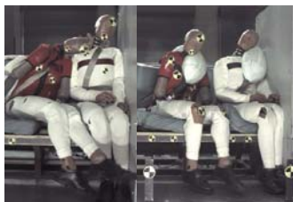
A tubular three-point restraint compared with a standard three-point restraint in a lateral impact.

Side-facing seats are used in limited but important configurations. Troop transport, medical evacuation, and other special vehicles require seat positions exposed to lateral impact forces. The body is more susceptible to non-longitudinal impact forces. The same airbag benefits apply for lateral impacts.